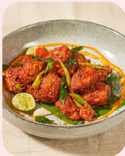
CHICKEN 65 (HYDERABADI STYLE)

Please Note: 5% GST and 5% discretionary service charges is extra on all