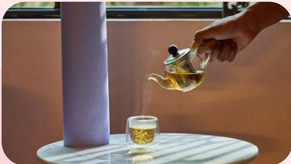
GREEN TEA POT

Please Note: 5% GST and 5% discretionary service charges is extra on all of the above prices