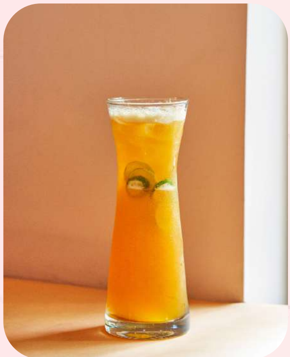
PEACH MANGO COOLER

Please Note: 5% GST and 5% discretionary service charges is extra on all of the above prices