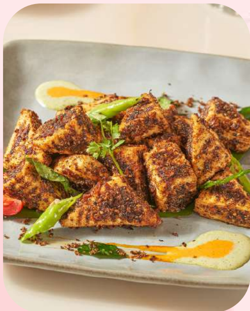
NALLA KARAM PANEER