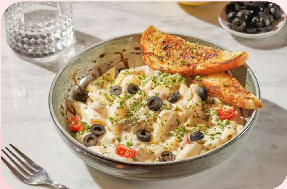
VEG PENNE PASTA ALFREDO

Please Note: 5% GST and 5% discretionary service charges is extra on all of the above prices