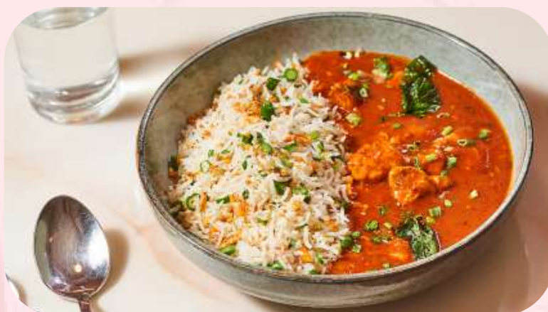
BURNT GARLIC FRIED RICE WITH CHICKEN HOT GARLIC SAUCE

Please Note: 5% GST and 5% discretionary service charges is extra on all of the above prices