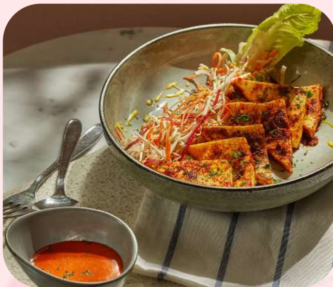
MOROCCAN GRILLED COTTAGE CHEESE

Please Note: 5% GST and 5% discretionary service charges is extra on all of the above prices