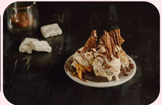
MOUNT NUTELLA SUNDAE

Please Note: 5% GST and 5% discretionary service charges is extra on all of the above prices