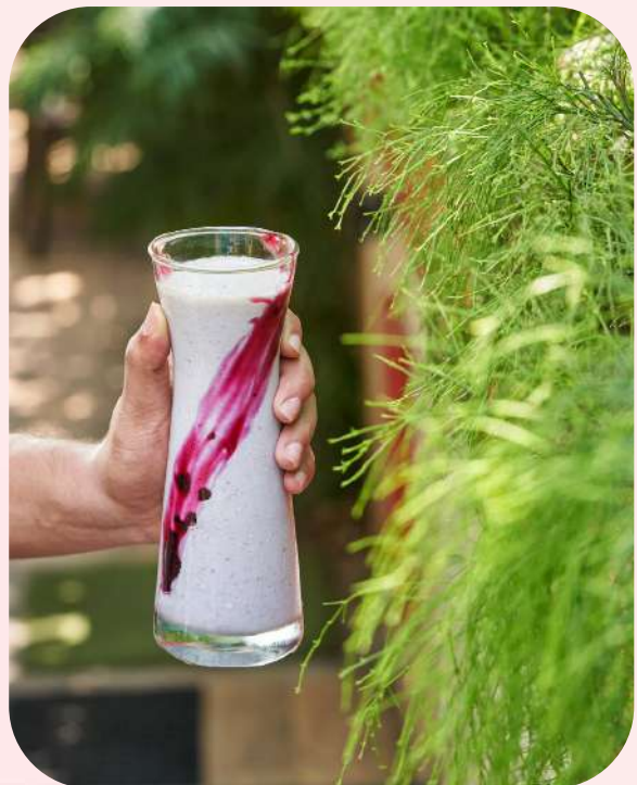
BLUEBERRY CHEESECAKE MILKSHAKE