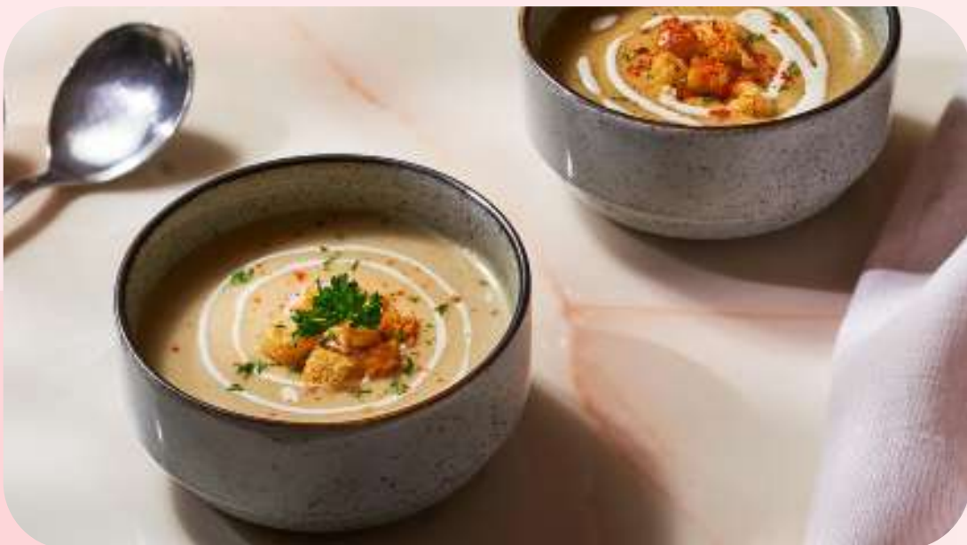
ROASTED GARLIC SOUP