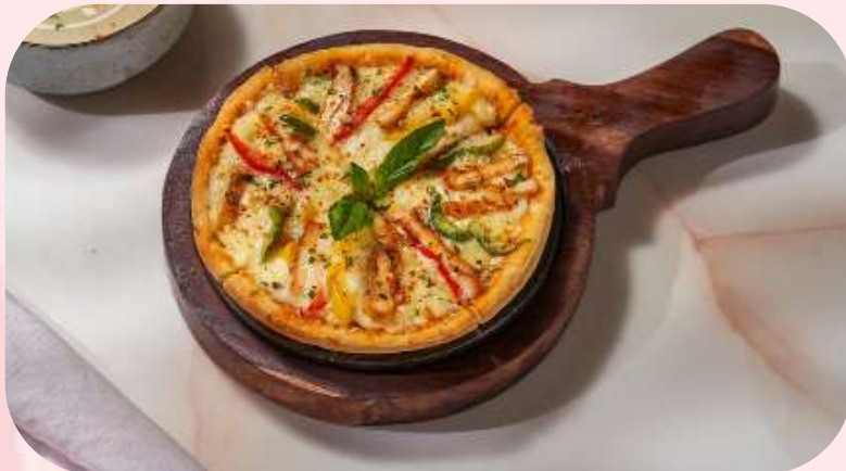
FARM FRESH DEEP DISH PAN PIZZA

Please Note: 5% GST and 5% discretionary service charges is extra on all of the above prices