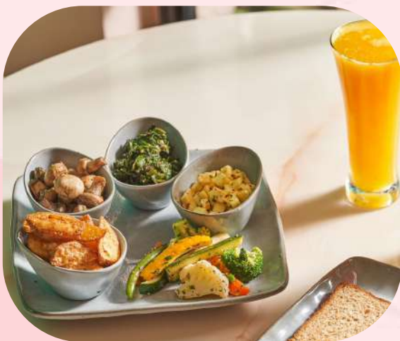
ALL VEGGIE BREAKFAST

Chicken Sausages, 2 Fried Eggs, Baked Beans, Sautéed Mushrooms, a Grilled Tomato topped with spinach; served with 2 slices of brown bread & butter