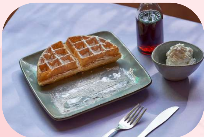
CLASSIC BELGIAN WAFFLE