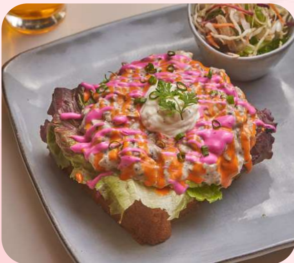
SPICED MUSHROOM & CHIVE CREAM