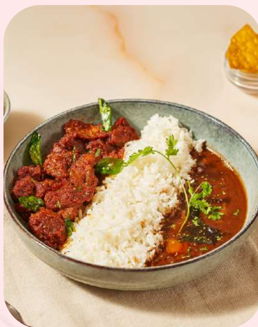
MUTTON ROAST W/ RICE ULAVACHARU