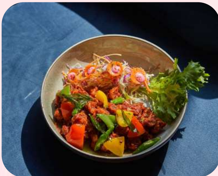
CHILLI GARLIC CHICKEN

Please Note: 5% GST and 5% discretionary service charges is extra on all of the above prices