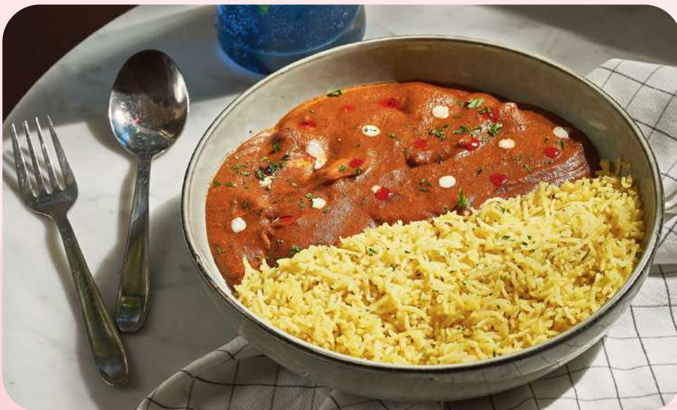
NAWABI CHICKEN RICE BOWL

Please Note: 5% GST and 5% discretionary service charges is extra on all of the above prices