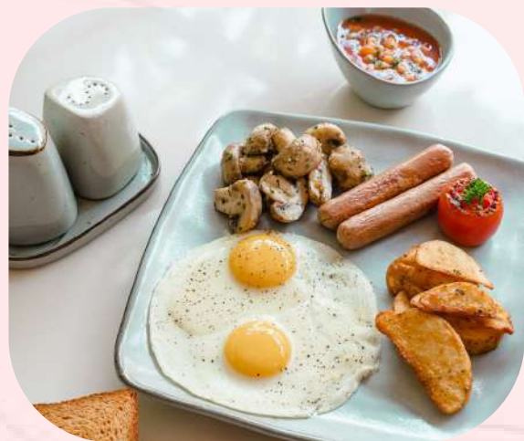
ALL ENGLISH BREAKFAST