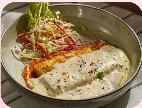
CHARGRILLED COTTAGE CHEESE CHIMICHURRI