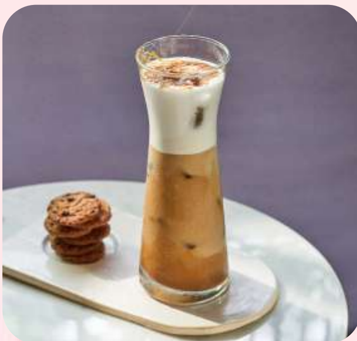
BAILEYS ICED COFFEE

Please Note: 5% GST and 5% discretionary service charges is extra on all of the above prices