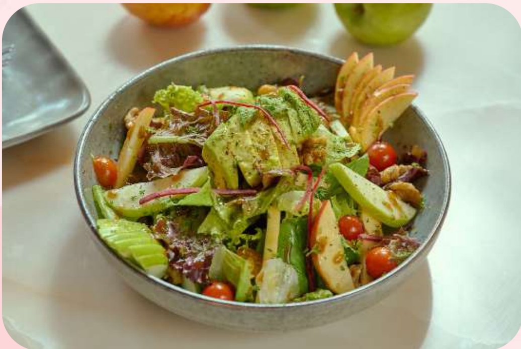
APPLE FETA CHEESE SALAD