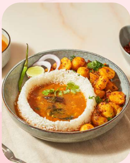
BABY ALOO ROAST W/ RICE & RASAM