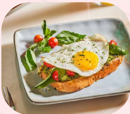
AVOCADO TOAST WITH SUNNY SIDE UP