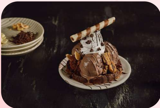
OBSESSIVE CHOCOLATE DISORDER SUNDAE

Hot fudge Brownie base topped with cookies & cream ice cream and cookie chunks